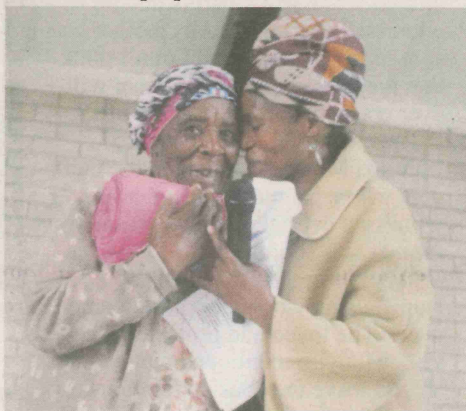
It was an emotional day.