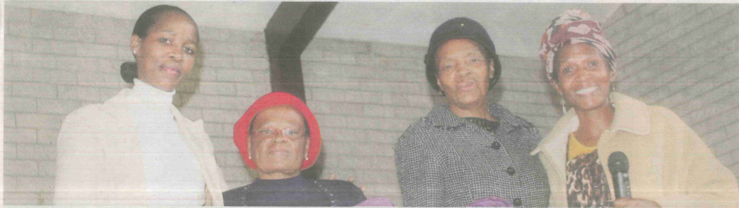
Posing for a picture with their gifts.