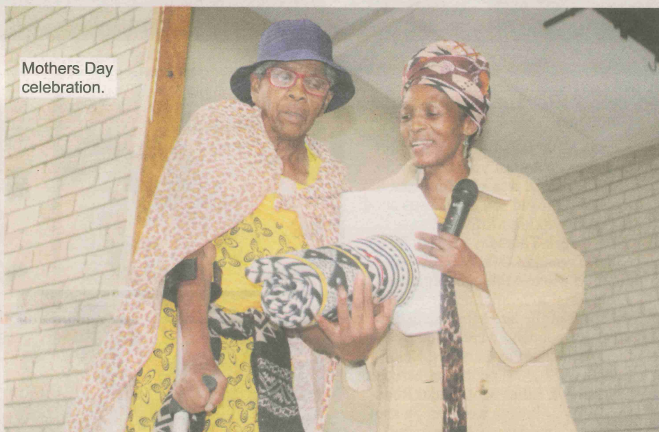
Mothers Day celebration.